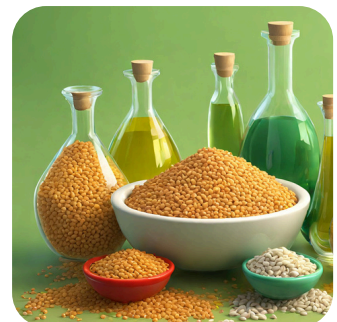
Oils and grains