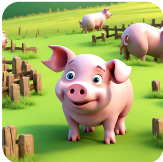
Frozen pork meat

Headquartered in Brazil, a country that has emerged as a leading global player in the food industry, with a product range that includes: