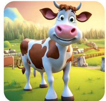
Frozen beef meat