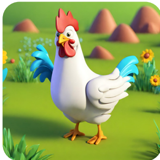
Frozen poultry meat