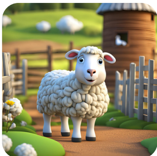
Frozen lamb meat